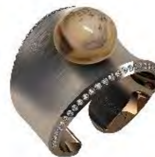
Croissy Pearls | @croissy_pearls