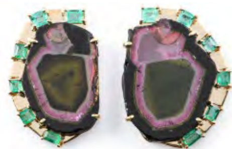
Sue Ling Jewelry | @suelingjewelry