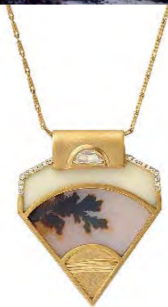
Monique Pean | @moniquepean