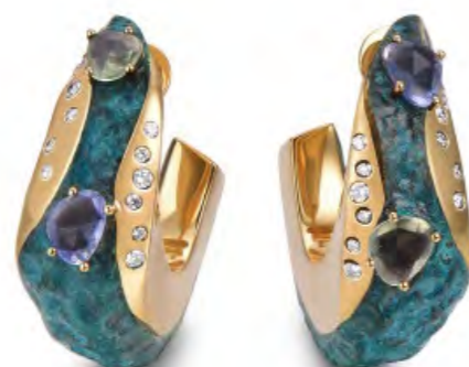
Grace Tang | @gracetang888