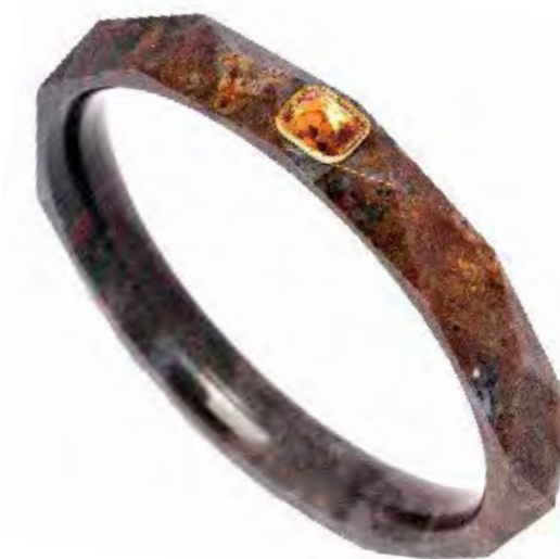
Olkaan Nishtah | @Olkaan_Nishtah